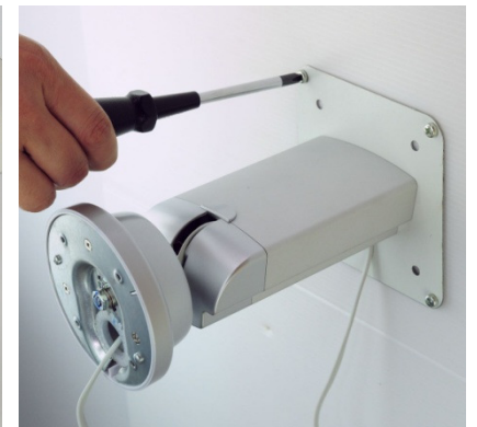
Mount the Hinge Device on the wall