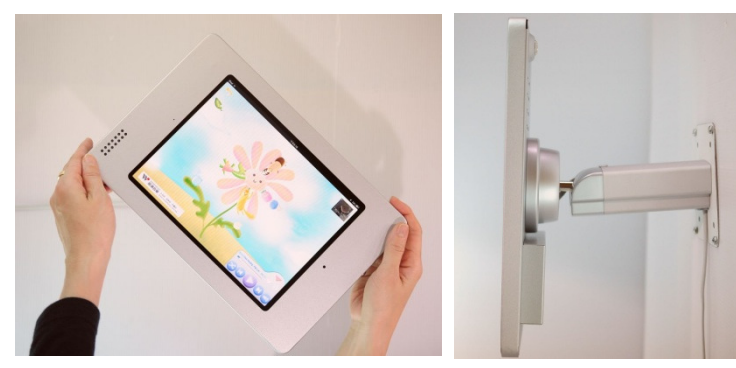
Lockable Pivot feature for landscape Viewing angle could be adjusted or portrait