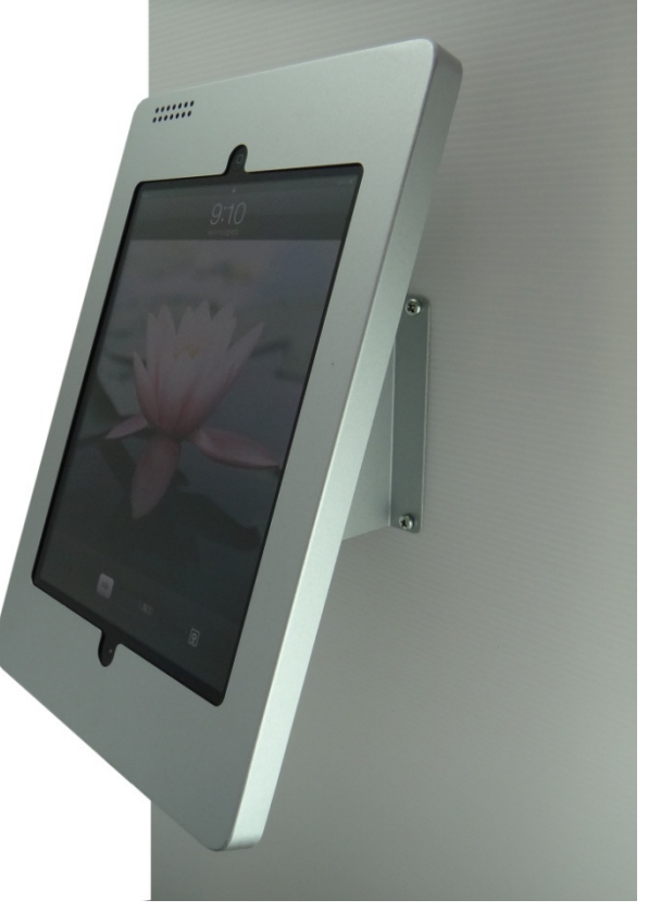
To provide a fixed viewing grade at 20 ° for looking down or looking up; different angle could be available depends on request