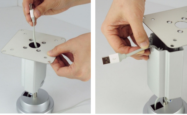
Power cable could be through or against the wall