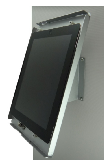
Put the iPad into the chassis