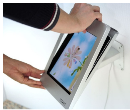
Put the iPad into the chassis