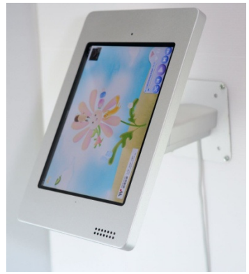
There is a pin hole to access home of iPad