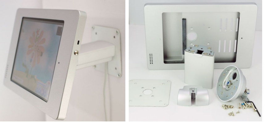
Installation direction decides to looking up or looking down