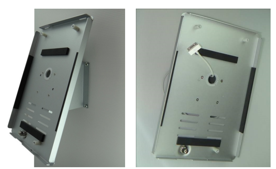
Allow to route the power cable inside the enclosure