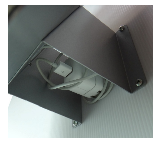
Adapter space reserved, can mount over wall outlet and hidden behind the bracket