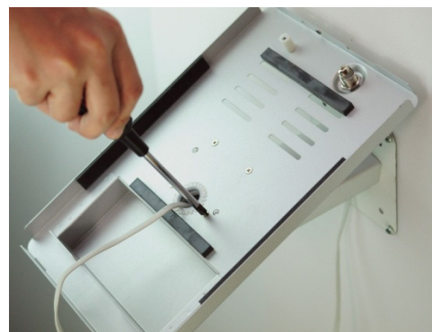
Mount the Enclosure to Hinge Device