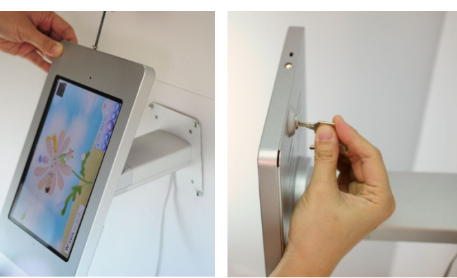
Lock the top cover with hex key or/and the CAM-lock in the back of enclosure